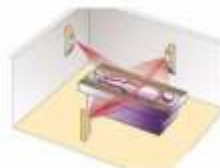
Red Fixed Laser LS-2 Three fixed laser system.