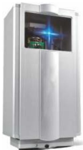
MICRO™ DIODE LASER