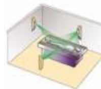
Green Fixed Laser LS-5 Three green fixed laser system offers horizontal and vertical mounting options.