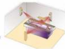
Red Fixed Laser LS-1 Four fixed laser system

Diacor offers three configurations for our Centralite red diode lasers that address common treatment requirements and make ordering from Diacor fast and easy.