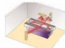
Red Fixed Laser LS-3 Three red fixed laser system with overhead mount.